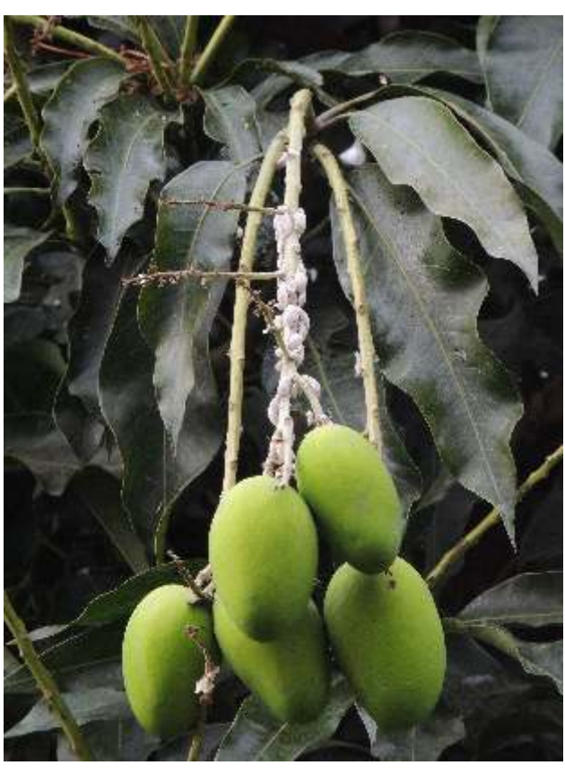
A bunch of mango infested with Mango mealy bugs and leaves covered with sooty moulds